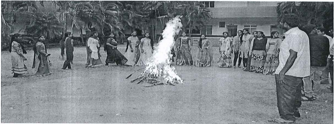
Holi Celebrations: Holikha Dahan