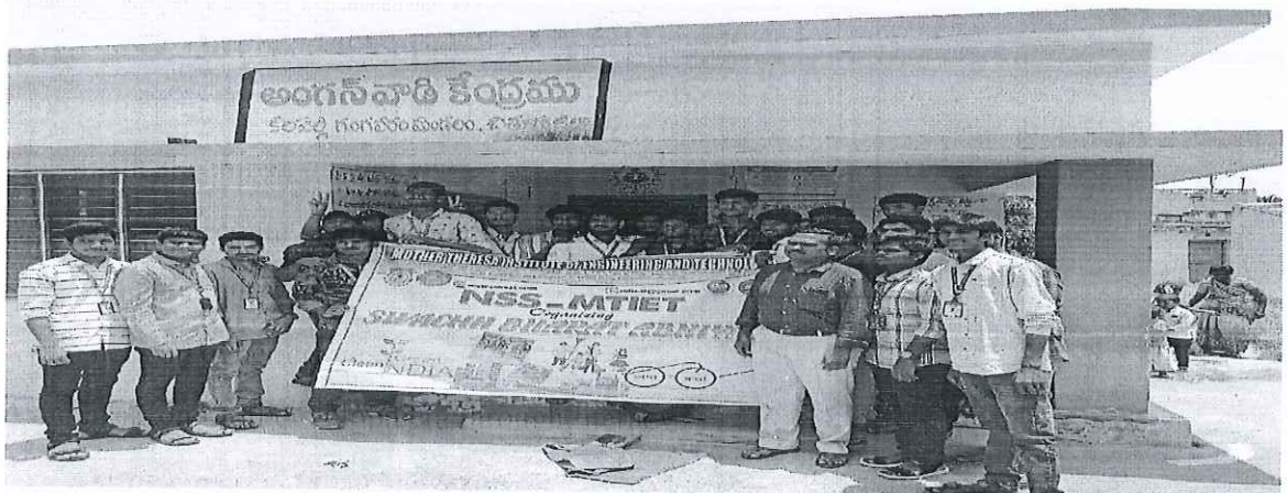
Swachh Bharath Abhiyan