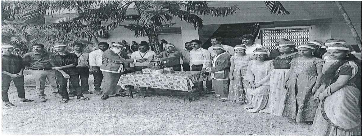
Christmas Celebration: Distribution of Gifts