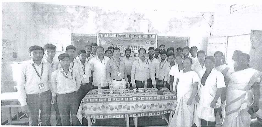
Free Medical Camp